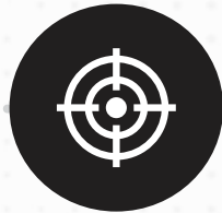
Lead QA & Delivery